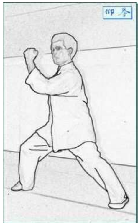
Yang Chuan Pugno Montante