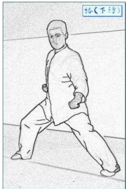
Ko Parata verso il Basso