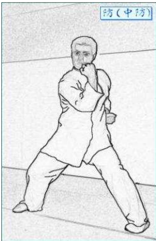
Fang Parata Media